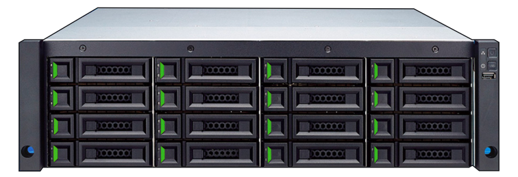
JetStor 816FX Fibre Channel SAN Platform with ATTO Celerity FC HBAs

All trademarks, trade names, service marks and logos referenced herein belong to their respective companies.