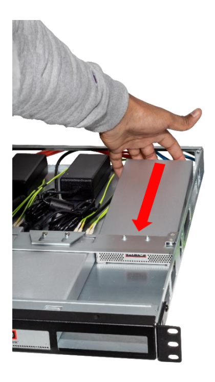
Note XstreamCORE 8100T is slightly longer than the Thunderlink.

7. Insert the unit from under the rail support as shown in the image below.